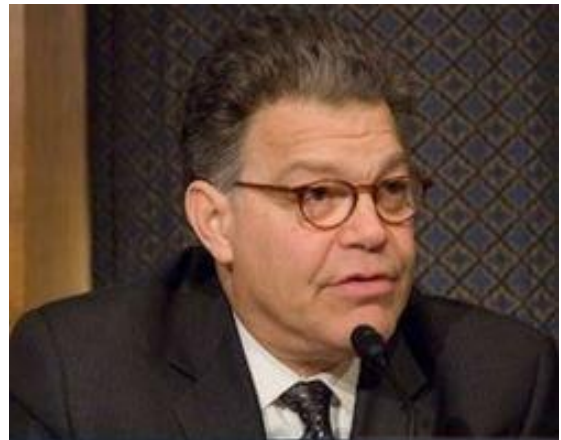
US Sen Al Franken (D-MN).