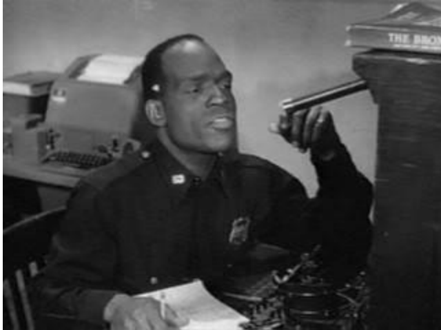
Nipsey Russell as Officer Dave Anderson