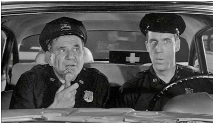
Joe E. Ross Officer Gunther Toody and Fred Gwynne as Officer Francis Muldoon