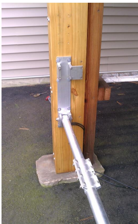
Tipper Jr. Mount with 1-3/4" Diameter – 1/4" thick wall Masts (2 – 12.0', 1 – 8.0' and Clamps for Sale by Barry - N1EZH.