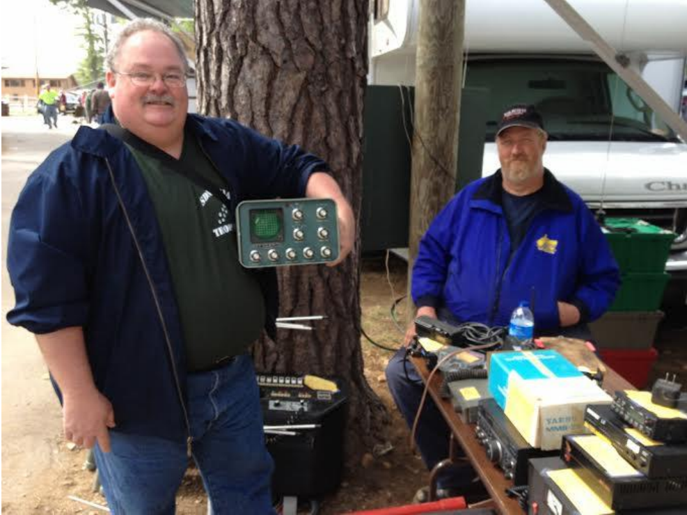
NEARfest participants Rick KB1TEE and Jim N1JCW