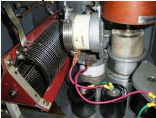
The plate tank circuit in the WH2XBA/1 VLF transmitter.