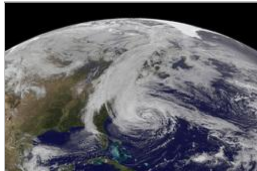
Hurricane Sandy as seen from NOAA's GOES-13 satellite on October 28, 2012.