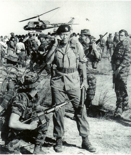
A young John Wayne in the flying Tigers 1942 and an older John in The Green Berets 1968