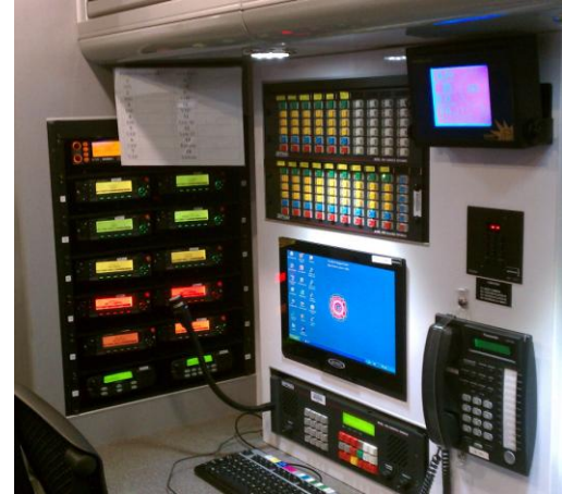
Carl Aveni N1FY 14 Radios (left) and patch panel (right)