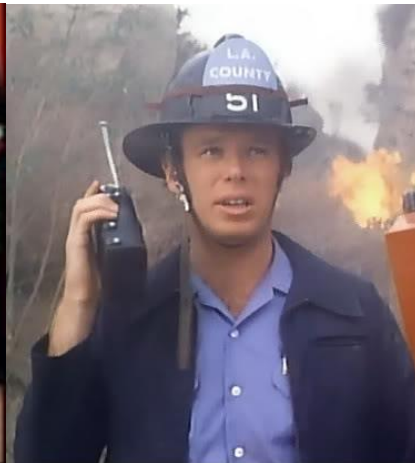
Squad 51 FF/Paramedic Gage and Desoto and FF Roy Desoto on the Handie talkie