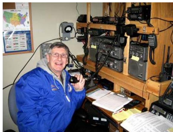
Special Event QSL Card