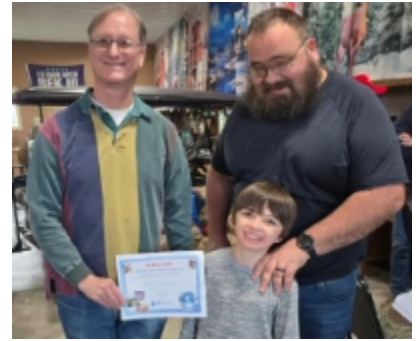
A young prospective ham is presented with a certificate from ARRL Kids Day last year.

https://www.facebook.com/share/g/1DqsHh2VBJ