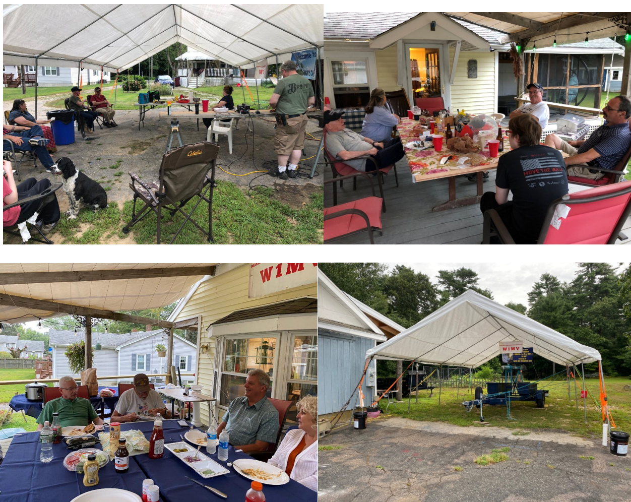
Past BBQSO photos