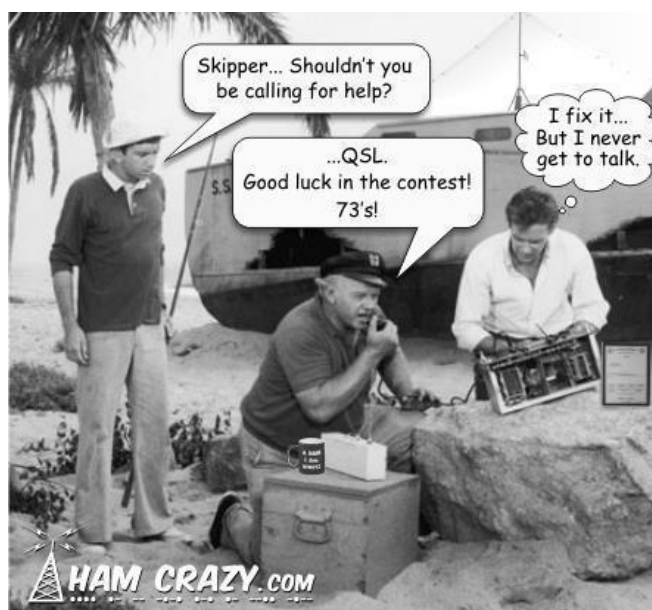
Just a little joy from Gilligan's Island